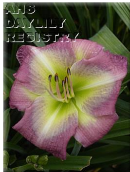
Westbourne Blue Moon